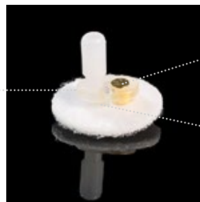
New .27 grams