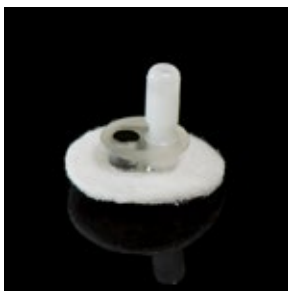
Old .30 grams

Part nos: VABM1B/25, VABM1B/22, VABM1BSM/25, VABM1BSM/22