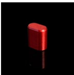
Old .52 grams

Part nos: VABM1C (red cap only) VABM1C-5 (sold as package of 5—one of each color)